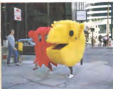
Pac-Man takes time off from his busy TV schedule to stroll downtown with one of his co-stars.

Pac-Man: I'd like to thank them for supporting my game. You know, a lot of people didn't think I had a ghost of a chance in the video game business. After all, I don't explode, or shoot, or crash, or anything like that. But you folks have made this mellow yellow fellow the champion champion of the world, and I appreciate that. □